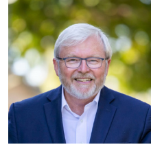
Kevin Michael Rudd

Co-Founder and Former Executive Chairman, Alibaba Group