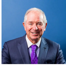
Stephen A. Schwarzman

Former Secretary of the Treasury, United States